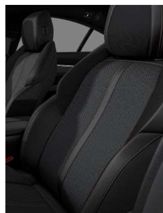
Mistral tri-material 'Belomka' leather effect and 'Ornis' cloth