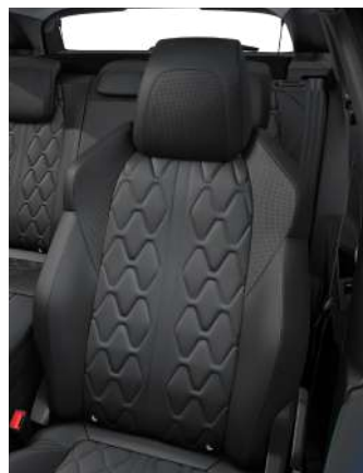
Mistral Nappa leather trim