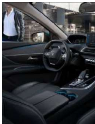
Half Leather effect trim with Mistral 'Colyn' cloth seat trim