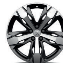
18" Los Angeles