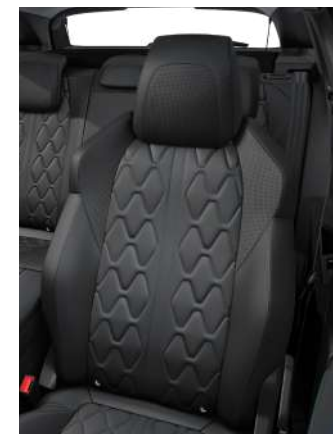
Nappa Mistral full grain leather trim