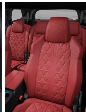
Red Nappa leather trim