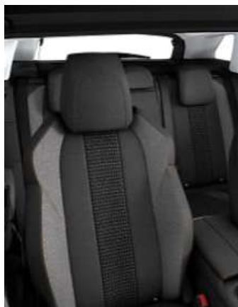
Mistral 'Meco' cloth seat trim