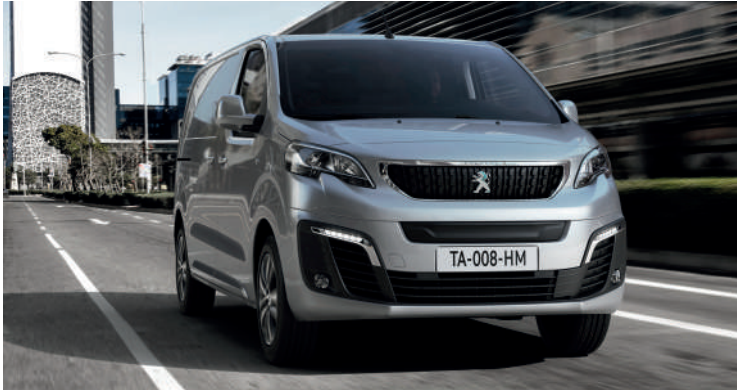
PEUGEOT e-Expert Front View