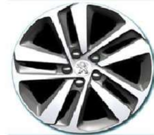
Optional 17" 'Phoenix' alloy wheel