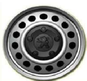
16" steel wheel with black centre cap