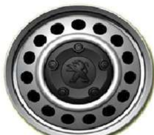
17" steel wheel with black centre cap