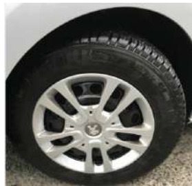
16" full steel wheel trim: standard on Professional models